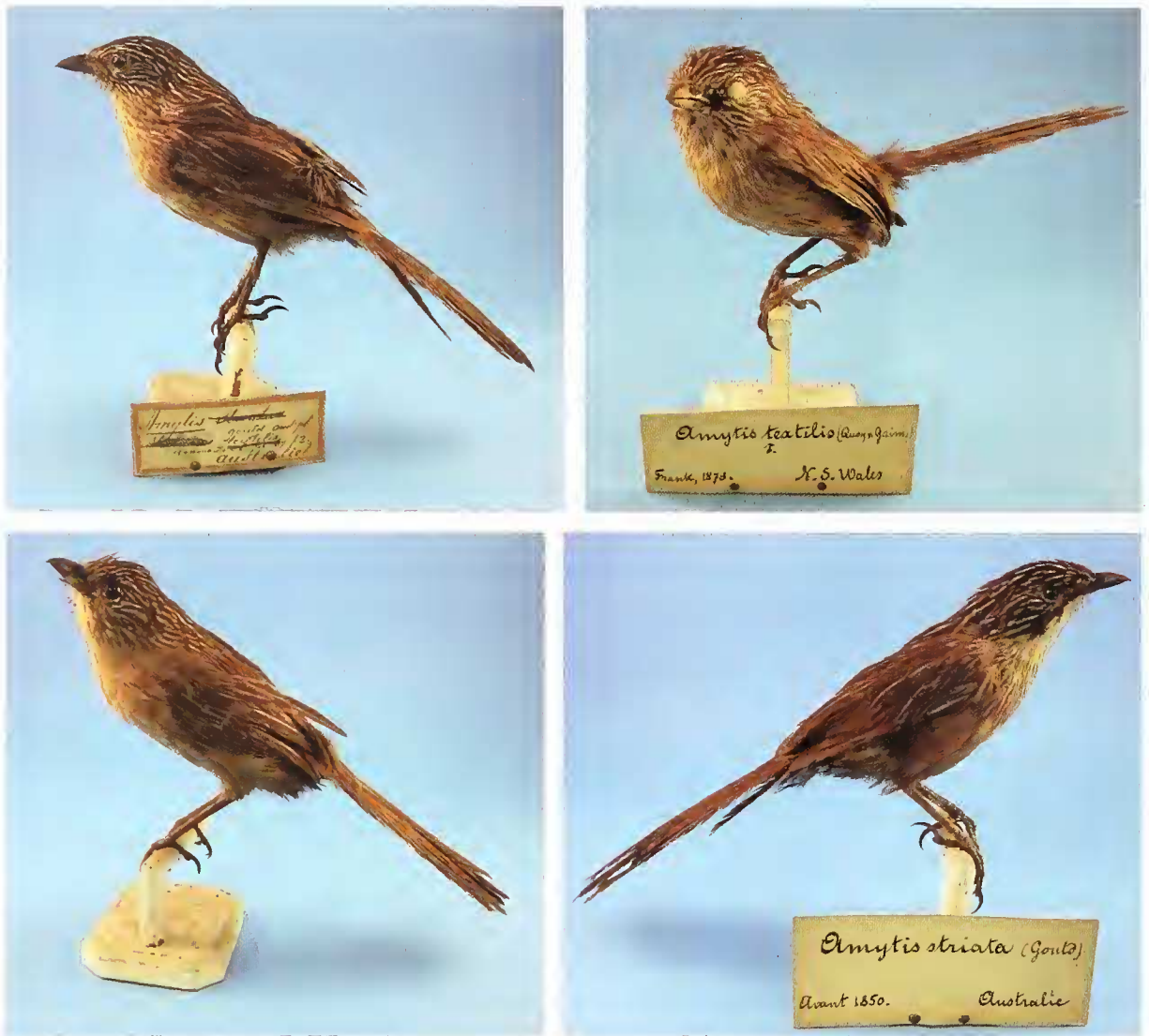
Figure 1. RMNH Aves 172018: female Amytornis modestus inexpectatus , from the collection of John Gould 1840–41, the plains bordering the lower Namoi, northern New South Wales (Justin J. F. J. Jansen)